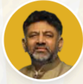
Shri D.K. Shivakumar Hon'ble Deputy Chief Minister