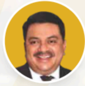
Shri S.S. Mallikarjun Hon'ble Minister of Mines & Geology and Horticulture