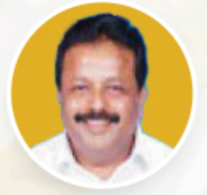
Shri. N. Chaluvarya Swamy Hon'ble Minister of Agriculture