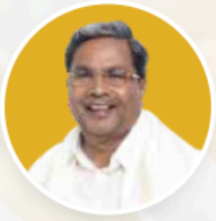
Shri Siddaramaiah Hon'ble Chief Minister